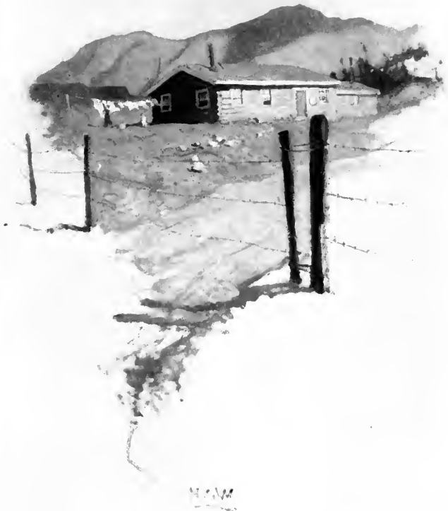
THE STEWART CABIN